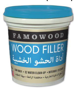
Net wt. 144 g (6 colors)